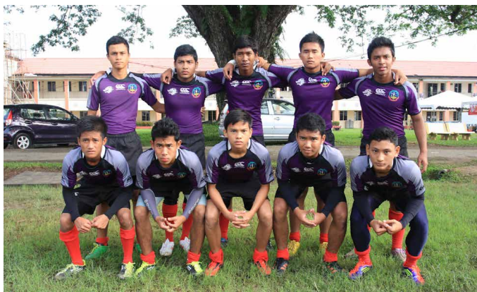
SEKOLAH MENENGAH SAINS POKOK SENA