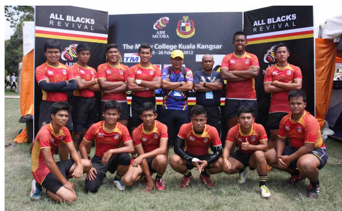
SEKOLAH MENENGAH SAINS SELANGOR