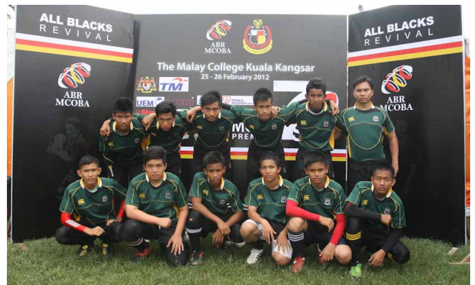
BUKIT MERTAJAM HIGH SCHOOL