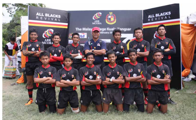
KOLEJ SULTAN ABDUL HAMID