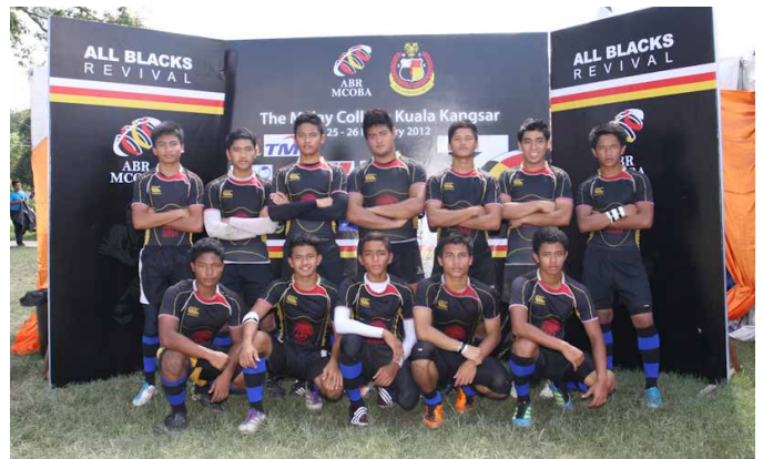
SEKOLAH DATUK ABDUL RAZAK