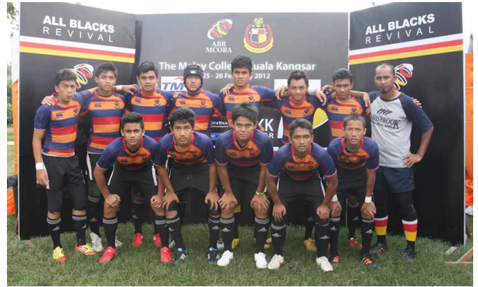
SEKOLAH MENENGAH SAINS HULU SELANGOR