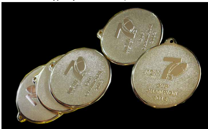
Medals & Prizes