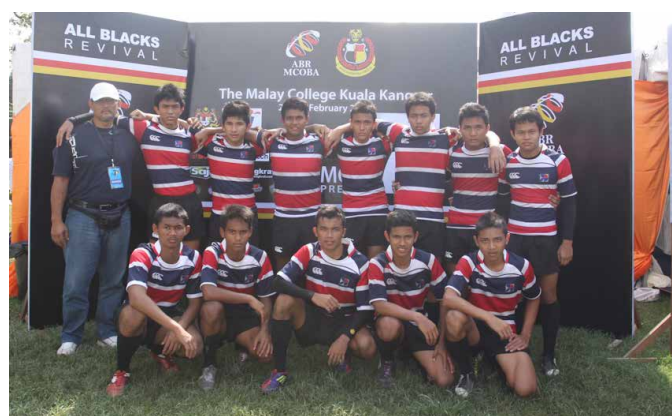
KOLEJ YAYASAN SAAD