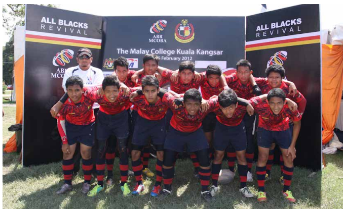
SEKOLAH SULTAN ALAM SHAH