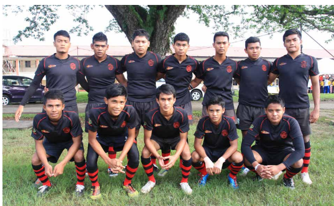
SMK KING EDWARD VII