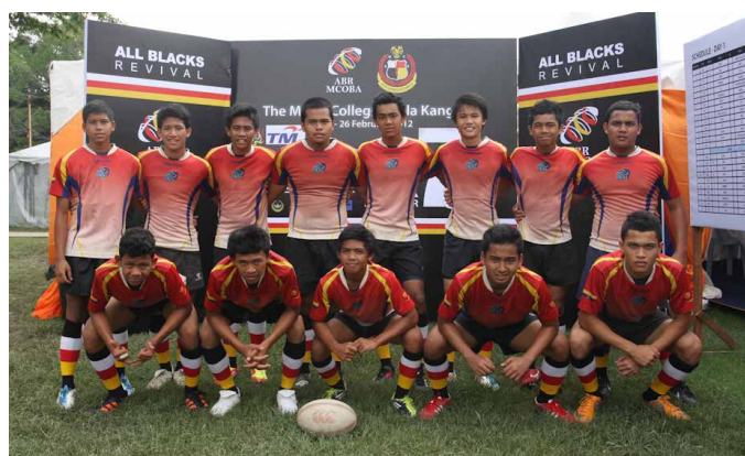
SMK TAMAN KOSAS