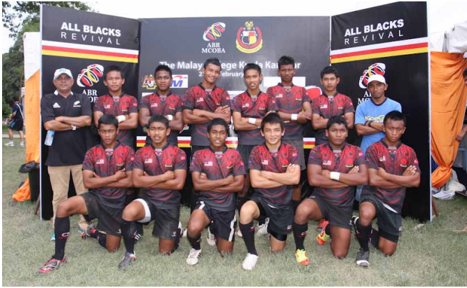
SEKOLAH SUKAN TUNKU MAHKOTA ISMAIL