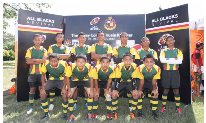
ROYAL MILITARY COLLEGE