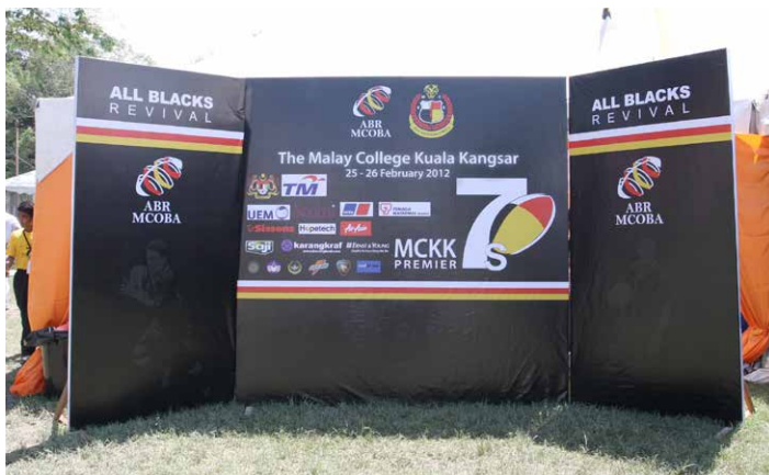
Wall of fame for interview and photo sessions

The buntings promoting the event were positioned on lamp posts along strategic route around the royal town of Kuala Kangsar, especially those leading to MCKK.