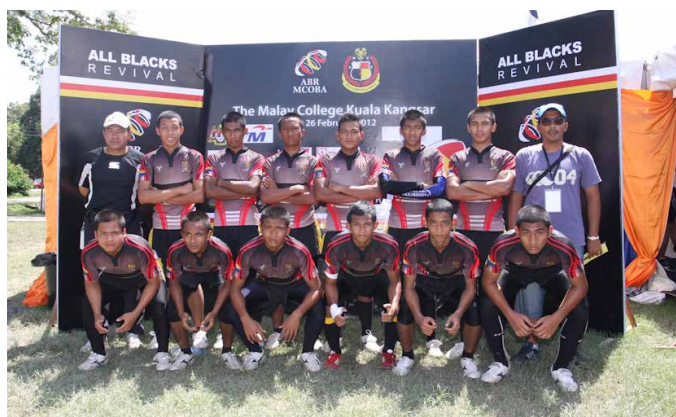
SM VOKASIONAL ARAU