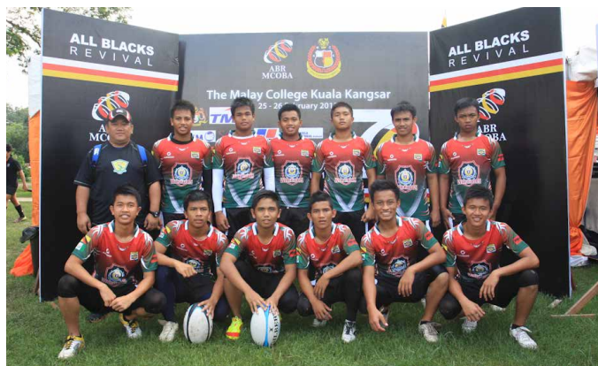
SMKA SHEIKH HJ OTHMAN ABD WAHAB