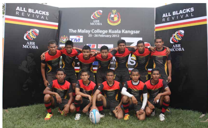
SMK SULTAN YAHYA PETRA 1