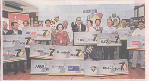
SOKONG...penganjur bersama sebahagian penaja pada majlis penyerahan tajaran di Kuala Lumpur, baru-baru ini.

leji Vajiravudh dan Anglo Chinese School Independence dari Singapura. Puspakom, Proton Holdings, PERNANIS Sandians, MTU Services (M) Sdn Bhd, Ernst & Young, Delima Oil Products Sdn Bhd, AirAsia Bhd dan Carribrook. Empat divisyen dipertandingkan iaitu Piala Saingan Utama (Divisyen 1), Saingan Plate (Divisyen 2), Saingan Bowl (Divisyen 3) dan Saingan Shield (Divisyen 4).