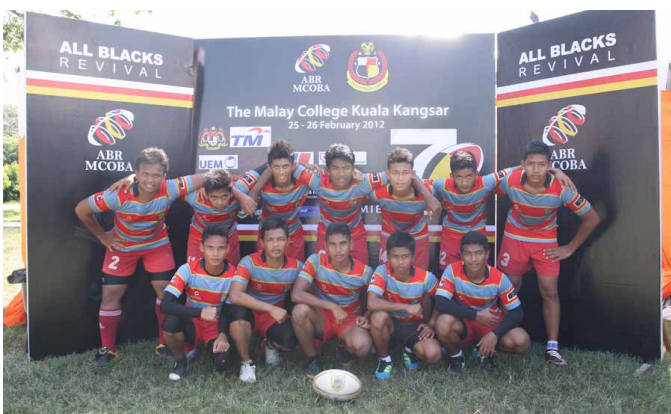
SEKOLAH MENENGAH SAINS SULTAN MAHMUD