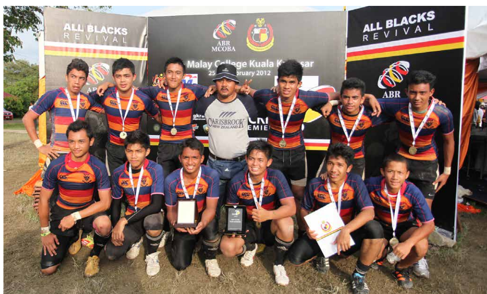
Plate Final bt STAR (19-17)