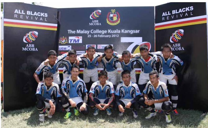
SBP INTEGRASI KUANTAN