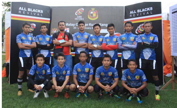
MRSM KUALA TERENGGANU