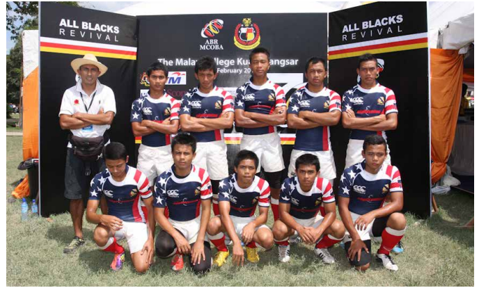
SEKOLAH TUANKU ABDUL RAHMAN