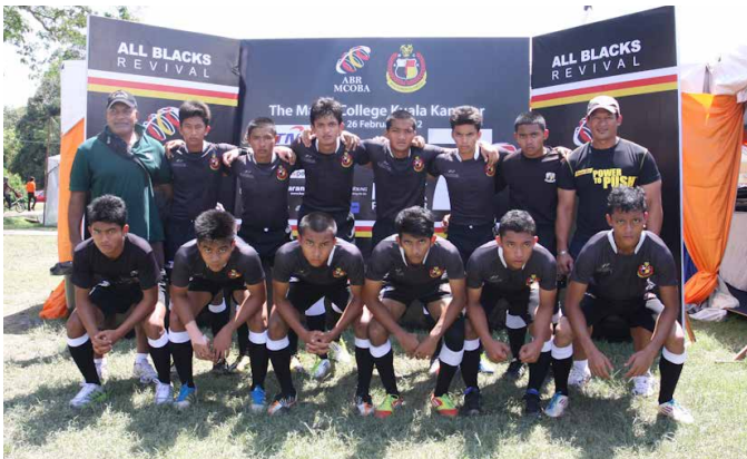
THE MALAY COLLEGE KUALA KANGSAR