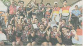
SSTMI celebrate their victory over SMSYP in the Malay College Kuala Kangsar Premier Sevens yesterday.