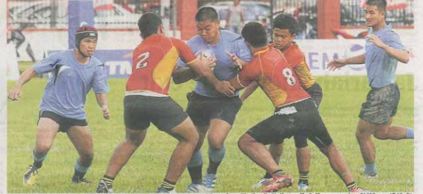
Three Sekolah Menengah Sains Selangor (SMSS) players try to stop a player from Thailand's Vajiravudh College yesterday. SMSS won 17-10.

HOSTS Malay College Kuala Kangsar (MCKK) were among the eight teams who qualified for the Cup/Plate quarter-finals of the MCKK Premier Sevens Rugby tournament in Kuala Kangsar yesterday.