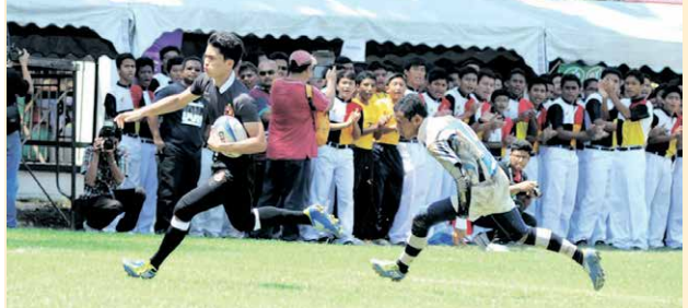
Pemain Kolej Melayu Kuala Kangsar (MCKK), berjaya meloloskan diri daripada halangan daripada pemain SBP Integrasi Kuantan sempena Kejohanan MCKK Premier 7s Rugby Tournament di Padang MCKK. Biarpun mempamerkan persembahan cemerlang di sepanjang kejohanan, skuad MCKK harau mampu layak hingga ke saingan separuh akhir sebelum tewas 7-12 pada waktu tambahan 'sudden death' kepada Sekolah Menengah Sultan Yahya Petra (SMSYP1) dari Kelantan.

Other qualifiers were last year's Plate final runners-up SM Sains (SMSS) and SM Sains Selangor. A total of 24 teams, including